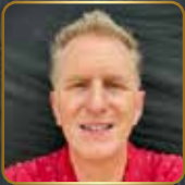
Michael Rappoport, Actor & Activist

"Shurat HaDin is one of the most important pro-Israel organizations operating in the world today. It elevates Israel advocacy merely from the streets, classrooms, and the media to courts of law where we can actually prevail for the State of Israel and for pro-Israel people around the country."