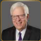
Dennis Prager, Author & Talk Show Host

"I had a great day at the Shurat HaDin Conference here in New York. I encourage everybody to get involved, to stay active, and to support. We as Jewish people, Israel, are dealing with unprecedented things so we must stay together, we must stay involved, and we must support. Am Israel Chai."