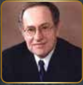
Professor Alan Dershowitz

"Shurat HaDin is one of the most important pro-Israel organizations operating in the world today. It elevates Israel advocacy merely from the streets, classrooms, and the media to courts of law where we can actually prevail for the State of Israel and for pro-Israel people around the country."