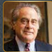
Attorney Ben Brafman

"I want to give my tremendous thank you and show my appreciation to Shurat HaDin. There have been a lot of nonprofits who talk about combating antisemitism, who talk about defending Jewish Students, but it is Shurat HaDin and its affiliates who are on the ground day in and day out suing Harvard University with alumni, taking social justice and antisemitic groups like the SJP to court, and we the students are incredibly grateful to Shurat HaDin, not only for amplifying our voices but for being part of the fight with us."